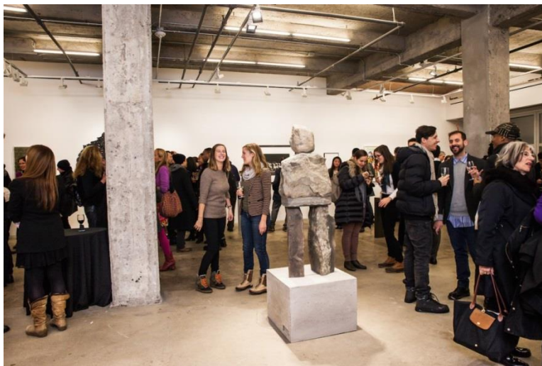
Building SCULPTURECENTER Benefit Exhibition SculptureCenter-mosphere