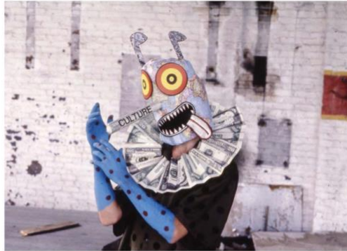
David Wojnarowicz, Untitled (Culture Mask I) , 1990. Fotografia.