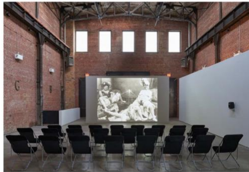
Banu Cennetoğlu, 1 January 1970 – 21 March 2018 • H O W B E I T • Guilty feet have got no rhythm • Keçiboynuzu • AS IS • MurMur • I measure every grief I meet • Taq u Raq • A piercing Comfort it affords • Stitch • Made in Fall • Yes. But. We had a golden heart. • One day soon I'm gonna tell the moon about the crying game , 2018. Veduta dell'installazione presso Sculpture Center, New York, 2019. Video, immagini, suono; 22 parti, 46,685 files. 128' 22". Metadata: 687 pagine, 27.9 x 43.2 cm. Commissionato e prodotto da Chisenhale Gallery, Londra. Fotografia di Kyle Knodell. Courtesy l'artista; Rodeo, Londra / Pireo.

David Wojnarowicz Photography & Film 1978-1992 / Reza Abdoh KW Institute for Contemporary Art Fino al 5 Mag, 2019 Auguststraße 69, Berlino