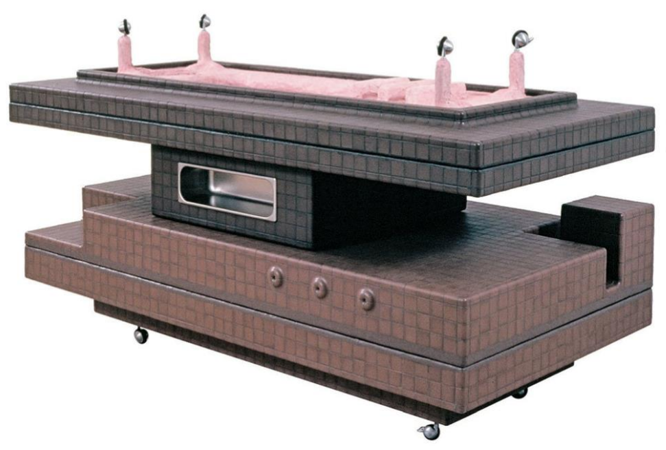
Tishan Hsu, Autopsy , 1988, plywood, ceramic tile, acrylic, vinyl cement compound, stainless steel, rubber, 55 × 49 × 94".

Matthew Ronay is a sculptor living in New York.