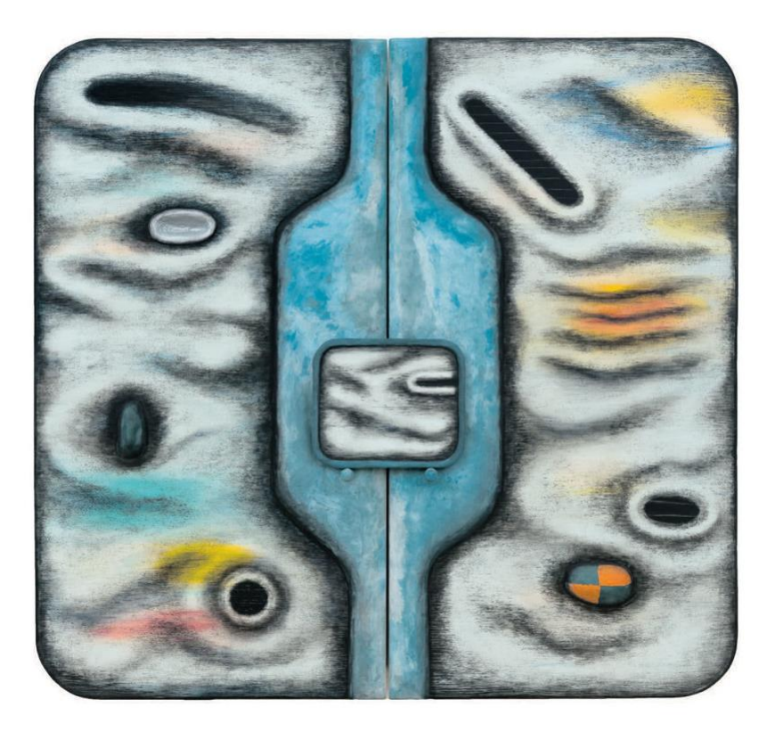
Tishan Hsu, Outer Banks of Memory , 1984, acrylic, alkyd, Styrofoam, and vinyl cement compound on wood, 90 × 96 × 15".

Even his more rigid tile pieces—such as Vertical Ooze, 1987, and Holey Cow, 1986—sag or bulge, as if he had merged neural networks with isometric drawings, skin tags, and booths for intergalactic spa treatments. Are they models of nature? How is it that this work feels simultaneously organic and technological? Why can't I stop thinking about drains and what kinds of liquids ran through them even though there are none here? I also see bunkers, sites of decontamination or compartmentalization. When I look at pool pieces like Heading Through, 1984, I wonder if I'm in the shower scene from the 1983 nuclear drama Silkwood. Or perhaps a germ-free future? The tile works are idealized, fantasy architectures, very useful if your goal in creating shelter is to express yourself. The eighteenth-century Neoclassical architect Claude-Nicolas Ledoux realized all manner of civic solutions for essentials such as pumping stations without jettisoning his sense of humor or heightened aesthetics, and I wonder what necessity these snippets of space Hsu has created embody. Hsu's are sites of self-care—future hammams where liniments are applied and dermabrasion happens and dead cells disappear down holes into pipes. Sometimes I imagine his cropped rooms are bodies: In Vertical Ooze, they sure look pressed against each other polyamorously. They're often tumescent—from pleasure? Or pain? Neither, since the whole world Hsu has created is a simulation. Or is it?