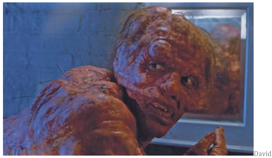
Cronenberg, The Fly, 1986, 35 mm, color, sound, 96 minutes. Seth Brundle (Jeff Goldblum).