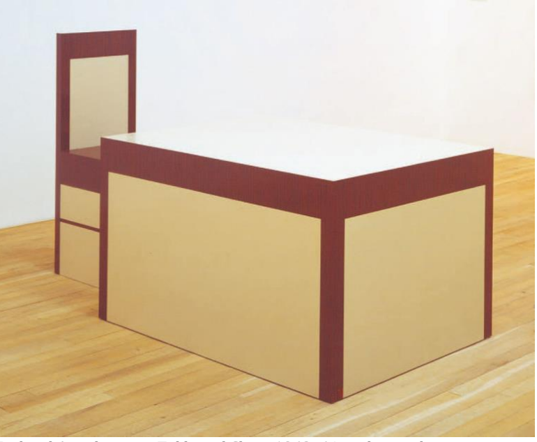
Richard Artschwager, Table and Chair , 1963–64, melamine laminate on wood; table: 29 3/4 × 52 × 37 1/2", chair: 45 × 17 3/4 × 21". © Artists Rights Society (ARS), New York.

But again, there were differences. Like other neo-geo artists, Hsu paid homage to the sleek Minimalism of the '60s and seemed especially drawn to the work of Richard Artschwager. But for Hsu—unlike, say, his contemporary Haim Steinbach, who was also influenced by Artschwager—it wasn't the older artist's Pop tendencies that were of interest; rather, it was the surrealism of his material choices, how his preference for synthetics over metals, for concoctions like Formica and Celotex, seemed less about the hard facts of industry than about the hocus-pocus of chemistry. Like Artschwager, Hsu favored a dyspeptic palette of drab browns and grays unsettled by sudden flashes of more pungent hue. And like Artschwager's, his work confounded its own status as autonomous art by flirting with the unassuming look of functional furniture and equipment, mere auxiliaries in a wider landscape of purposive activity.