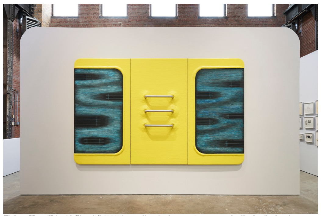
Tishan Hsu, "Liquid Circuit" (1987), acrylic, vinyl cement compound, alkyd, oil, aluminum on wood, 90 \times 143 \times 9 inches

In the early 1980s, the painter, sculptor, and all-around technological savant Tishan Hsu landed a night job as a "word processor" at a Wall Street law firm. Encountering early computers before they entered widespread use, Hsu spent his shifts engrossed in a now mundane task: staring at a screen. Entranced by the symbiosis between user and machine, Hsu has continued to probe the interstices between the virtual and the physical over the past four decades, blending elements of architecture, medicine, and computer processing into inimitable hybrid objects. Following a debut at the Hammer Museum in Los Angeles in January, "Tishan Hsu: Liquid Circuit," his first museum survey, was scheduled to arrive at SculptureCenter in New York in May. Delayed due to the pandemic, the exhibition opened in September in an interlinked, computer-dependent world Hsu prophesied. Encompassing paintings, sculptures, drawings, and videos, the show traces an arc from the dawn of personal computing to the advent of social media.