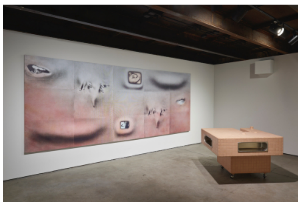
View of the exhibition "Tishan Hsu: Liquid Circuit" at SculptureCenter.

Hsu's first exploratory paintings are curious creations, straddling the border between two and three dimensions. Couple (1983) and Squared Nude (1984), vertical wooden panels composed of paint and mixed mediums, evoke Futurism reinvented for the digital age: instead of capturing a flurry of movement made newly visible by photography, they render human cells and orifices as if pixelated on a staticky screen. To create that effect, however, Hsu scratched and etched into his wooden surfaces. Later paintings continued to grapple with the "space" of a screen; to capture both material flatness and virtual depth, Hsu often thrust three-dimensional objects violently through the picture plane. In Outer Banks of Memory (1984), a miniature "screen" rests jauntily against a larger canvas; Fingerpainting (1994), a silkscreen print, juxtaposes Renaissance-esque depictions of outstretched hands with screen-mediated body parts. Despite his interests in technology, Hsu never relinquished a manual sensuousness. (Indeed, some of the main delights of the show are his drawings and smaller studies; delicate, finely lined, and whimsically colored, they are frequently jotted down on whatever Hsu had at hand—a scrap of paper, legal letterhead, an envelope.)