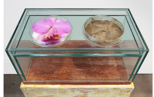
In "Orchid, Buttermilk, Penny" (1987), which takes the form of two petri dishes presented under glass, microorganisms ravage buttermilk, the petals of an orchid and a copper penny. Liz Larner; Cathy Carver

And in "2 as 3 and Some, Too" (1997-98), the steel frames of two open cubes — a form associated with the rigid geometries of <u>Sol LeWitt</u>, among others — seem to have been smooshed together as easily as one might crumple a foil candy wrapper. Larner has wrapped them in sheets of mulberry paper, which she has also tinted with watercolor in Easter-egg hues. The piece is large, measuring 137 inches at its widest point, but appears extremely delicate.