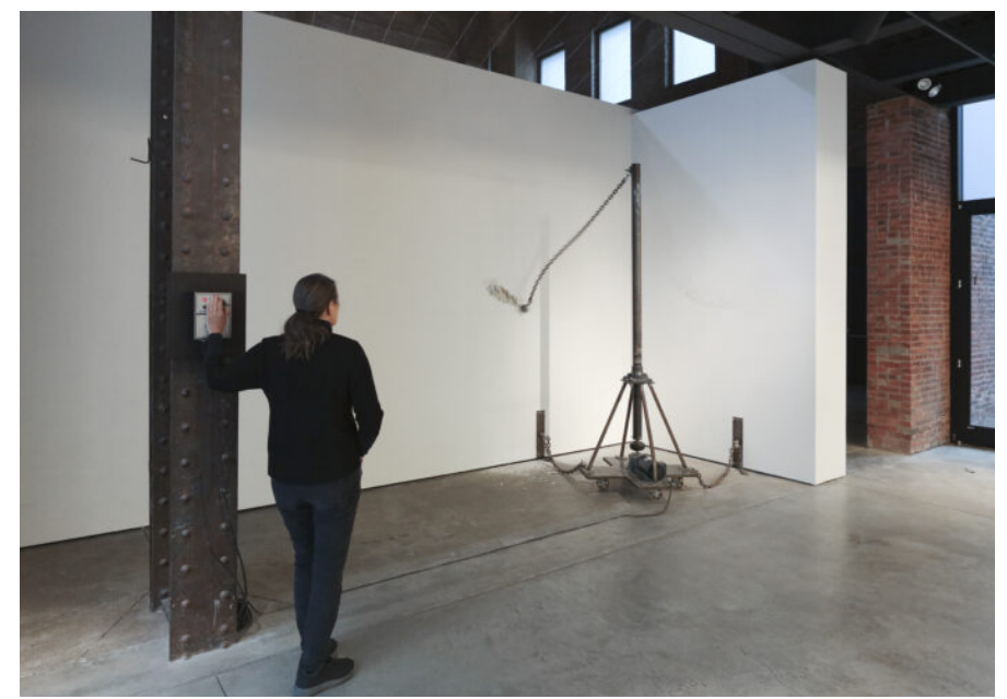
Liz Larner, Corner Basher , 1988, installation view, Liz Larner: Don't put it back like it was , SculptureCenter, New York, 2022. Steel, stainless steel, electric motor, speed control. 120 \times 37 inches (304.8 \times 94 cm). Gaby and Wilhelm Schürmann Collection, Herzogenrath and Berlin. © Liz Larner.