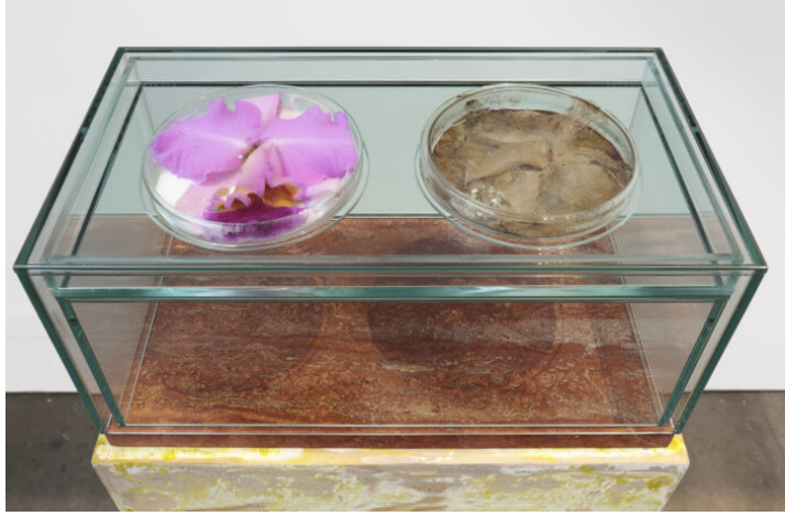
Liz Larner, Orchid, Buttermilk, Penny, 1987. Orchid, buttermilk, penny, glass. 43 7/16 x 17 1/2 x 10 1/8 inches (110.2 × 44.5 × 25.7 cm). Private collection. © Liz Larner.