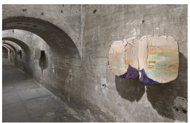
Installation view, Liz Larner: Don't put it back like it was , SculptureCenter, New York, 2022. © Liz Larner. Photo: Cathy Carver. Artworks in installation view (R to L): Liz Larner, Marthe , 2019 Liz Larner, xiii (caesura) , 2014–15 Liz Larner, calefaction , 2015 Liz Larner, inflexion , 2013