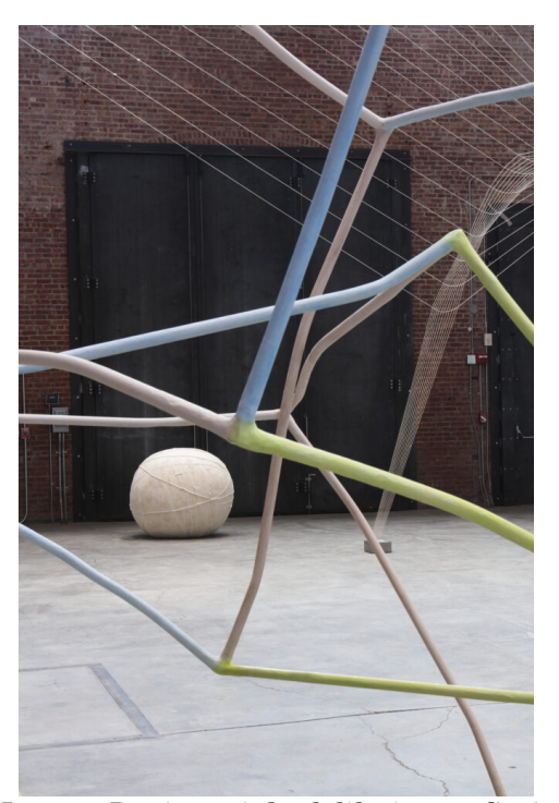
Installation view, Liz Larner: Don't put it back like it was, SculptureCenter, New York, 2022. © Liz Larner. Artworks in installation view: Liz Larner, 2 as 3 and Some, Too, 1997–98 Liz Larner, Out of Touch, 1987 Liz Larner, Bird in Space, 1989