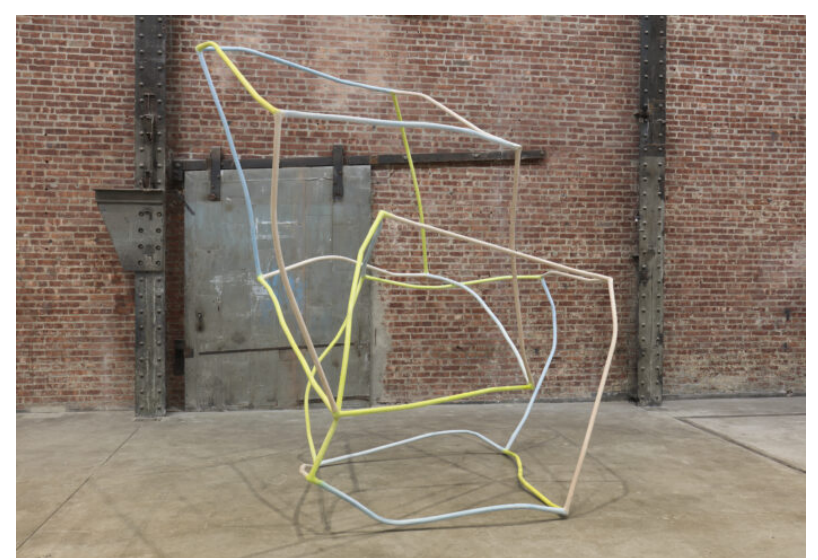
Liz Larner, 2 as 3 and Some, Too, 1997–98, installation view, Liz Larner: Don't put it back like it was, SculptureCenter, New York, 2022. Mulberry paper, steel and watercolor. 112 \times 137 \times 95 inches (284.5 \times 348 \times 241.3 cm). Museum of Contemporary Art, Los Angeles; Purchase in memory of Stuart Regen with funds provided by Thea Westreich and Ethan Wagner, Pam and Dick Kramlich, Norman and Norah Stone and Chara Schreyer. © Liz Larner.