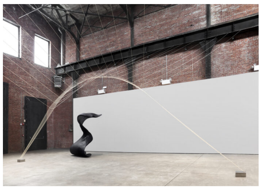
Installation view, Liz Larner: Don't put it back like it was , SculptureCenter, New York, 2022. © Liz Larner. Artworks in installation view: Liz Larner, Bird in Space , 1989 Liz Larner, V (planchette) , 2013