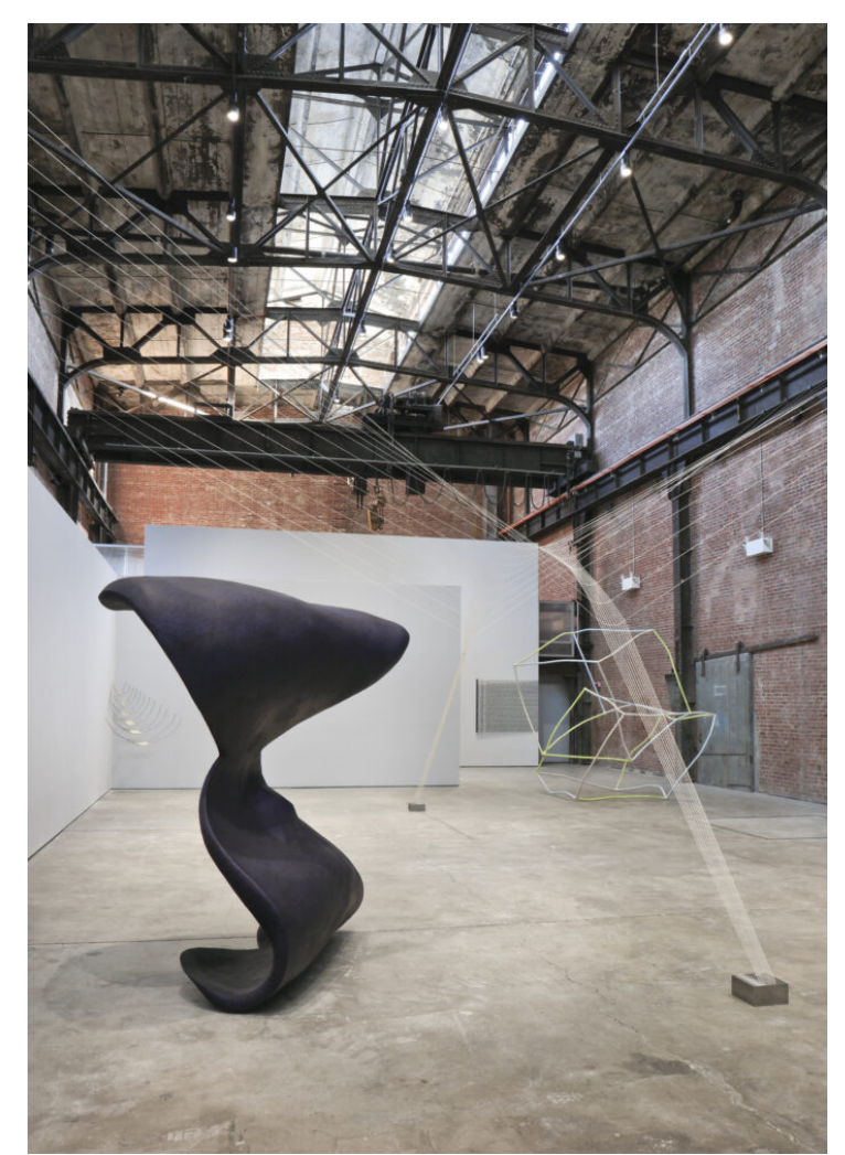
Installation view, Liz Larner: Don't put it back like it was , SculptureCenter, New York, 2022. © Liz Larner. Artworks in installation view: Liz Larner, Bird in Space , 1989 Liz Larner, V (planchette) , 2013 Liz Larner, Too the Wall , 1990 Liz Larner, 2 as 3 and Some, Too, 1997–98 Liz Larner, Wrapped Corner , 1991

44-19 Purves Street Long Island City, NY 11101 +1 718 361 1750 sculpture-center.org