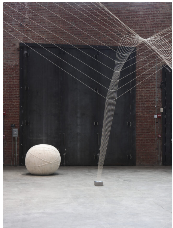
Installation view, Liz Larner: Don't put it back like it was , SculptureCenter, New York, 2022. © Liz Larner. Artworks in installation view: Liz Larner, Out of Touch , 1987 Liz Larner, Bird in Space , 1989