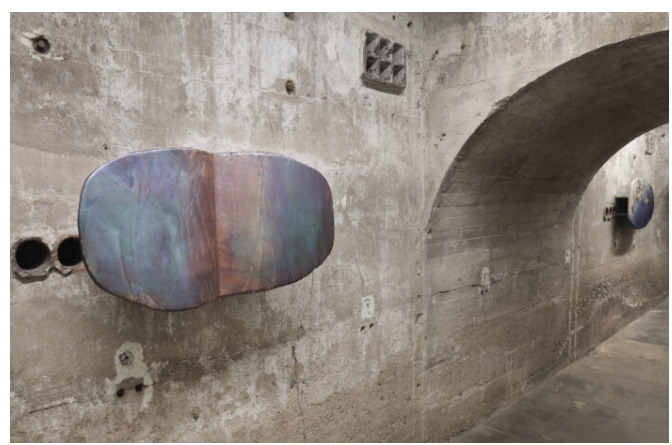
Installation view, Liz Larner: Don't put it back like it was , SculptureCenter, New York, 2022. © Liz Larner. Artworks in installation view (L to R): Liz Larner, inflexion , 2013 Liz Larner, calefaction , 2015