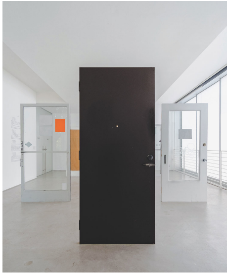
View of "Fiona Connor: Closed Down Clubs," 2018, Garage Top, Mackey Apartments, MAK Center for Art and Architecture, Los Angeles.