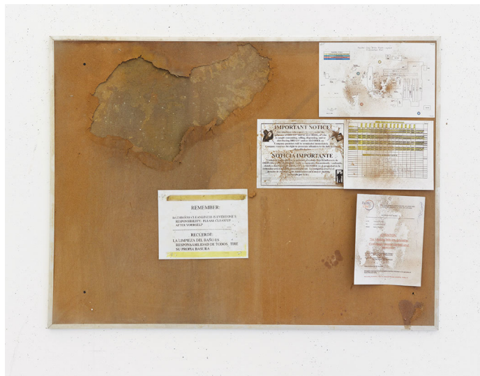
Fiona Connor, Notice Board (Pacific Clay) #2, 2016 , corkboard, paint, silk-screen and UV print on aluminum, pins, tape. Installation view, University of California, Los Angeles.

Connor's remakes—recurring subjects include bulletin boards, walls, doors, and public fountains—are startling simulations of seemingly banal objects that nevertheless prove to be carriers of significant material and social histories. The artist stumbled on the ComSci bulletin boards in UCLA's Boelter Hall, the staid, brick-clad home of the university's computer-science department, where, remarkably, engineers sent the very first message over Arpanet, a precursor to the modern-day internet; the room in which this occurred is now preserved and displayed behind glass like a diorama at a natural—history museum. Connor's investigation of Boelter Hall coincided with a series of lectures and walking tours she gave on the proprietary bricks used in the construction of buildings throughout the UCLA campus—architects George W. Kelham and David Allison first used Norman bricks for their Lombard Romanesque—style buildings in the late 1920s, and the practice continues today. This history eventually became the subject of Connor's 2016 exhibition, which took place in an architecture-department classroom and included re-creations of bulletin boards from the Pacific Clay factory in Lake Elsinore, California, where all of the bricks at UCLA are fabricated.