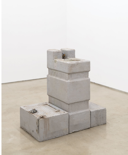
Fiona Connor, On What Remains (fountain), 2015, concrete, expanded polystyrene foam, antique brass hardware, plumbing supplies, steel, plywood, paint, coatings, car battery, pump, water. Installation view, Lisa Cooley Gallery, New York.

Though replication is a recurring tactic for Connor, it's not her only one: Elsewhere, including at the 2018 exhibition "The Green Man" at Talbot Rice Gallery at the University of Edinburgh, the artist has taken existing doors and simply relocated them in the space they initially resided—often snugly inserting them into gallery walls while leaving the original doorframes empty. At the Talbot Rice show (which was organized by artist Lucy Skaer), Connor removed the door from an otherwise-overlooked storage closet and plugged it into the middle of a gallery wall. This tactic shifts the emphasis away from the artist's virtuosic tricks—her trompe l'oeil simulations of objects and architectural details—and toward attentiveness itself as an act and a value to be shared between the artist and her viewers.