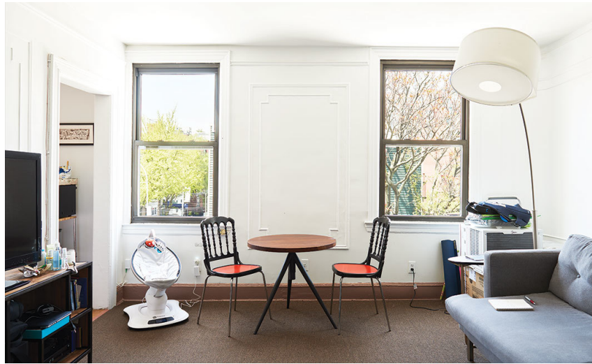
Site of Fiona Connor's #4, 2019–, annual window cleaning. Long Island City, NY, 2019. From the series "Sequence of Events," 2017–.

of manual or artisanal labor. It's worth noting that the tools in question are not only, or are not specifically, those of an artist.