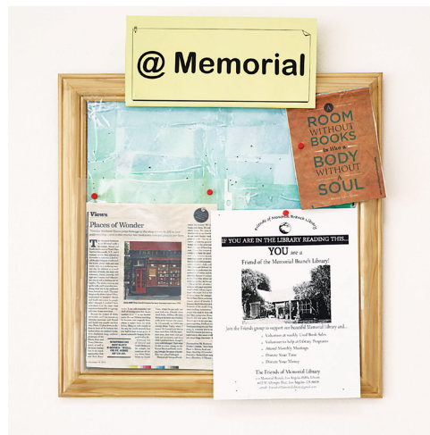
Fiona Connor, Community Notice Board (Library) , 2015, custom corkboard, paint, silk-screen and UV print on aluminum, vinyl, thumbtacks, staples, tape, plastic sleeve, 22 × 19".

A full exhibition of “new” bulletin boards followed the Sydney presentation at 1301PE gallery in Los Angeles in 2015, revealing a surprising variety of forms and uses. These bulletin boards were modeled on ones found at various sites around the city, where the artist is currently based, with subtitles that casually point to their sites of origin: Community Notice Board (Pizza) , 2015, is a haphazard array of flyers, business cards, and provisional scraps of information, collectively pitching haircuts, concerts, and free English lessons to Spanish speakers; by comparison, Community Notice Board (Library) , 2015, is tidily composed, with a careful selection of library-related matter crowned by a yellow “paper” sign that reads @MEMORIAL—presumably the name of the library but also a double entendre marking the passage of time.