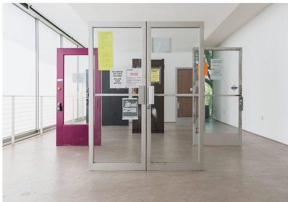
View of "Fiona Connor: Closed Down Clubs," 2018, Garage Top, Mackey Apartments, MAK Center for Art and Architecture, Los Angeles.