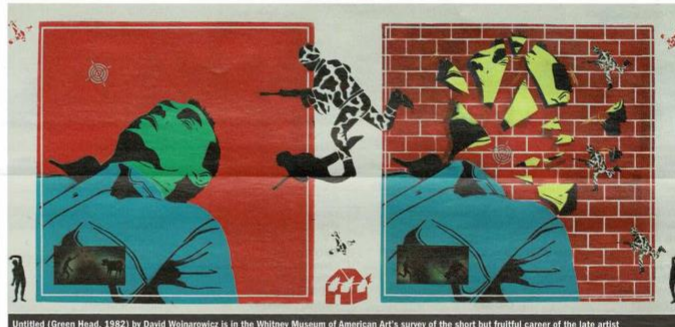
Untitled (Green Head, 1982) by David Wojnarowicz is in the Whitney Museum of American Art's survey of the short but fruitful career of the late artist