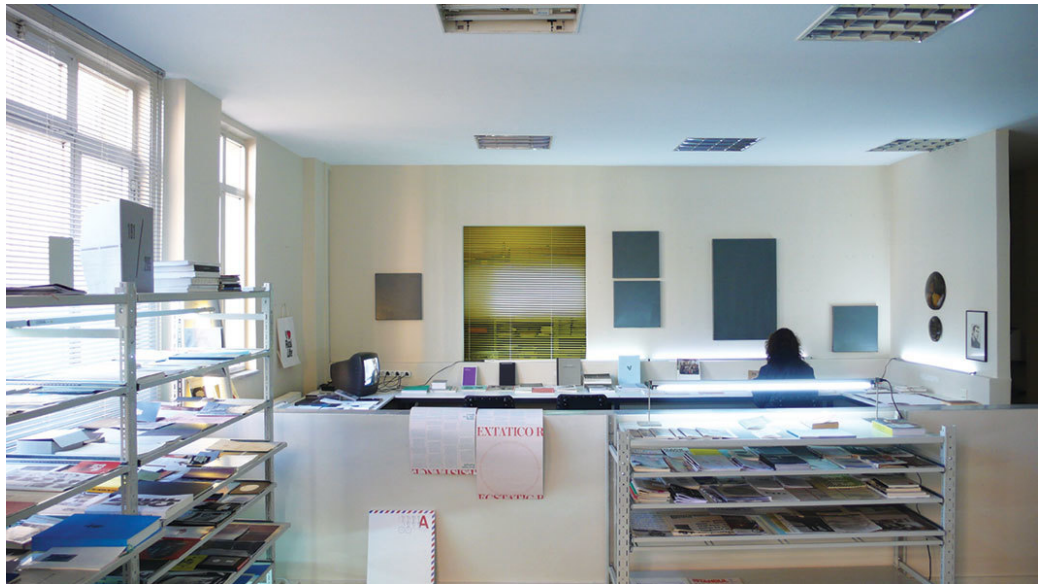
View of BAS, Istanbul, 2015.