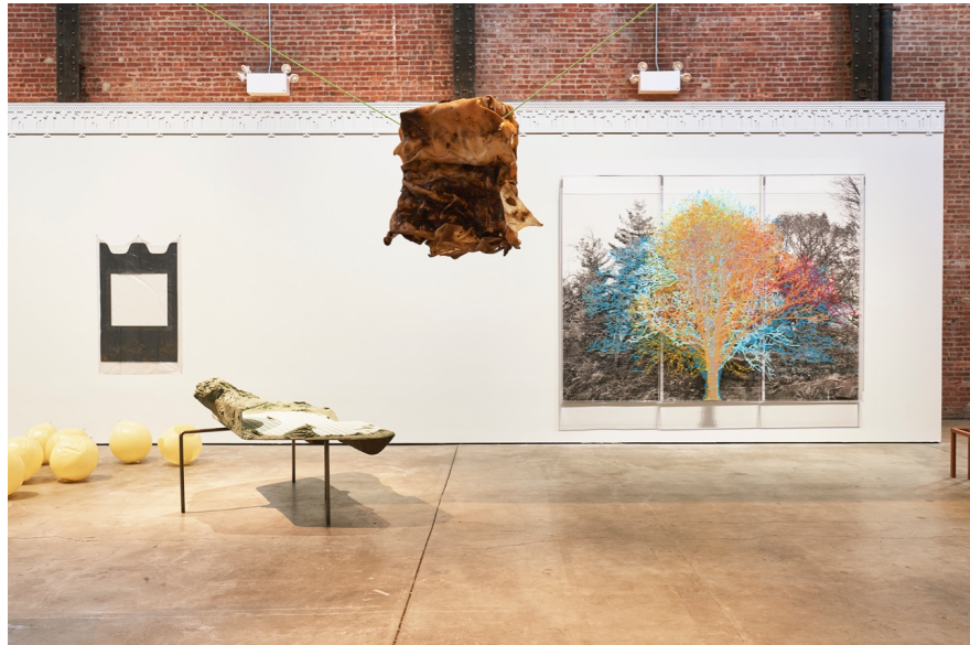
Searching the Sky for Rain, installation view.

At a SculptureCenter show, enigmatic erasures and self-conscious looking.