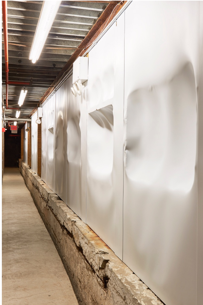
Rafael Domenech, Tactics for a new architecture (excerpts from Severo) , 2019 (detail). Styrene, 3M adhesive, fluorescent light bulbs, vinyl, building, dimensions variable. Courtesy the artist. Photo: Kyle Knodell.

It takes careful and attentive listening to hear nothing; likewise, the exhibition as a whole requires careful and attentive looking, which sometimes involves a hunt for the artwork indicated on the exhibition map—another form of erasure, perhaps: the obviation of how we’re used to looking at an exhibition. Back downstairs, I stupidly wandered up and down one of the labyrinthine basement’s corridors, hunting for Rafael Domenech’s Tactics for a new architecture (excerpts from Severo) (2019), until I finally noticed one wall was discretely covered with a white Styrene skin. I didn’t think to gaze upward, but instead had to be told that the artwork continued on the ceiling, where vinyl letters are stuck onto long tubes of harsh fluorescent lights to create a poetic and oblique narrative in Spanish and English (these lightbulb-poems are also found at the top of the stairwell going back to the first floor). Also on the first floor, a glazed pottery by ektor garcia (tocado, 2019) hides atop a doorway; and way up high, close to the soaring ceiling, a sensuous piece of dirt-smudged rawhide dangles from the clerestory windows: Rindon Johnson’s The stage is no place for the riot (ongoing). You have to look around and crane your neck and squint to see some of these artworks—there is no pretense of a neutral, standardized act of viewing. You are acutely aware of yourself as you try to see.