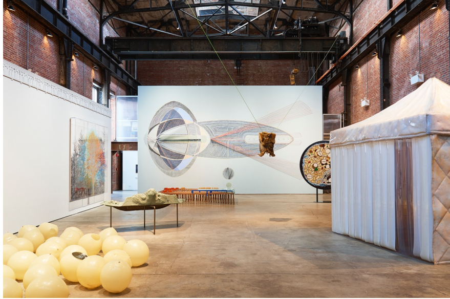
Searching the Sky for Rain , installation view.

Searching the Sky for Rain may operate by removal, but it is not empty—it is filled with so many, often beautiful, somethings. It's just that I find I cannot name all of them, nor the ties binding them together; or maybe they need to be conjugated with a subtler grammar than the one I know—something like Cokes's vernacular of possibility. His subjunctive "what if" constructions reminded me of how some languages are graced with special, specific unrealis moods, like the oblique, which can be used to express an experience that was not lived by the speaker, but was learned from others; or mirativity, which allows one to stress astonishment at the unknown or recently learned. Perhaps sitting in uncomfortable bewilderment a while could lead me to think of more nuanced declensions to articulate those astonishing things I do not yet know. Or perhaps it is not for me to find this language at all, but instead to learn the grammar of others as they give language to something that is not mine.