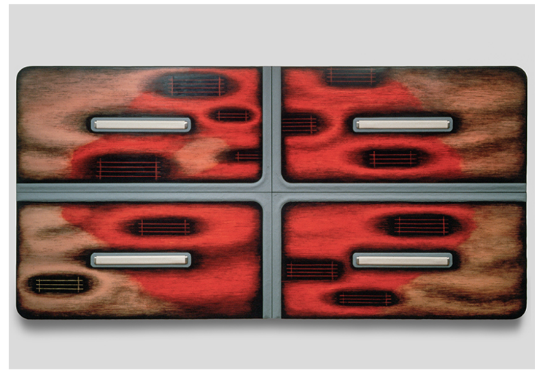
TISHAN HSU, CELL, 1987.