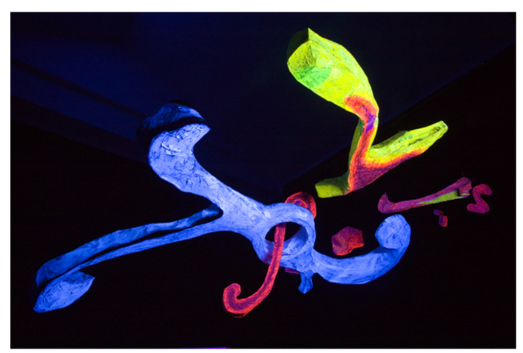
LUCIO FONTANA, "AMBIENTE SPAZIALE A LUCE NERA [SPATIAL ENVIRONMENT IN BLACK LIGHT]", 1948–1949.