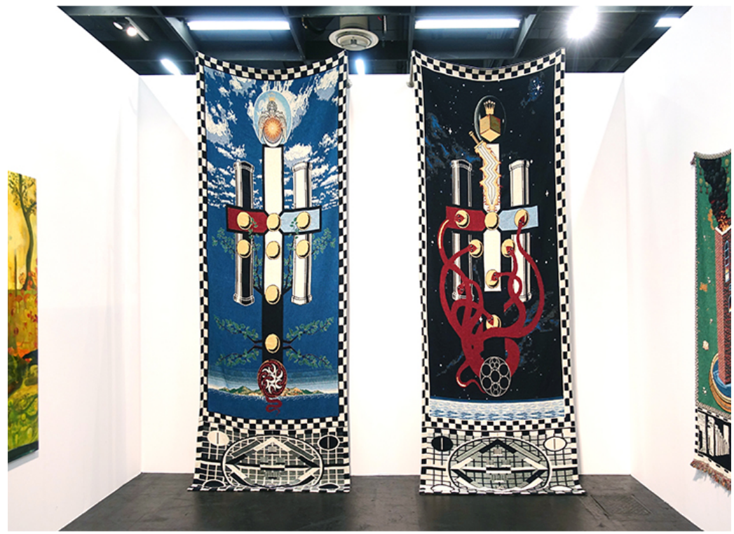
BENJAMIN ASAM KELLOGG, THE GARDEN BEFORE/AFTER THE FALL, 2019.