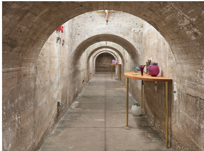
"An Archive from Two Perspectives," (2017) installation view, Photo Courtesy: Kyle Knodell

top, wind inside its interior, then snake through its punctures, dropping limply onto a round cherrywood platform. The title tips its hat to perversity, pleasure, and the pornographic, but any transgressions are formal, straight-faced, simply demonstrating that what goes in must come out.