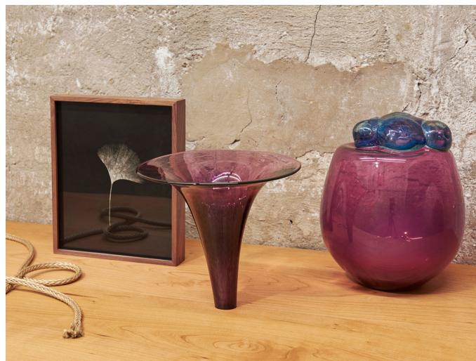
Details from Kelly Akashi's Long Exposure

Although heady and entirely graceful, there is also something decidedly macabre about Akashi's art. Severed extremities, curling candles burnt, wax drippings, hanging ropes, glass vessels flayed open like skin and half-filled with still water: the undercurrents of her installations aren't exactly violent, but carry an energy that might be called "post-event," possessing an unsettled presence somewhere between detritus and memorial. The SculptureCenter's drafty, raw-walled basement galleries always feel more like a crypt beneath a cathedral than an exhibition space, and Akashi's work makes best use of its unshakable creepiness. Down here, her oddities—candles wrapped around a bronze branch; creamy, abstract photograms made by placing her glass works onto paper; more vessels, hands, and fingers—take on the aura of relics.