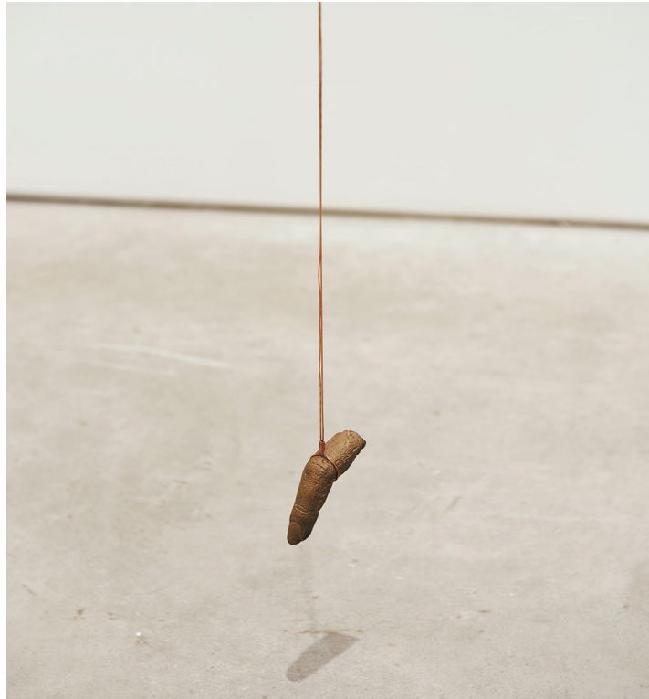
"Finger Figure," (2017)

In one of Akashi's weirdest moves, a bronze finger with a torn-up nail pokes out the top of a pale blue glass funnel lying on the Archive table. Out its rear extends a generous tail of rope—a bizarro creature, unnatural if logically constructed. A hole occasions one of two conditions: emptiness, or occupation. (Nature abhors a vacuum; art despises a lost opportunity.) With this piece, Akashi seems to signal a future phase of all this collapse: Out of the old come new beings, new beginnings, new unearthly concoctions.