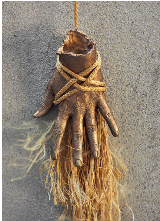
Detail from “Feel Me”, Photo Courtesy: Kyle Knodell

vement of light. But here, the main light source is electric, somewhat constant, so the finger and its shadow are suspended not only in space, but in time.