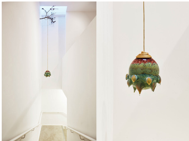
Details from Kelly Akashi's Long Exposure

vement of light. But here, the main light source is electric, somewhat constant, so the finger and its shadow are suspended not only in space, but in time.