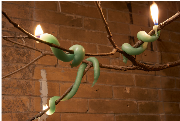
Detail of "Carbon Copy," (2017)

difficult it was to see the bronze branch, read its details, since against the lightwell it mostly disappeared into silhouette.